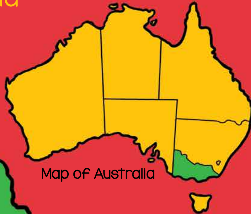
Map of Australia