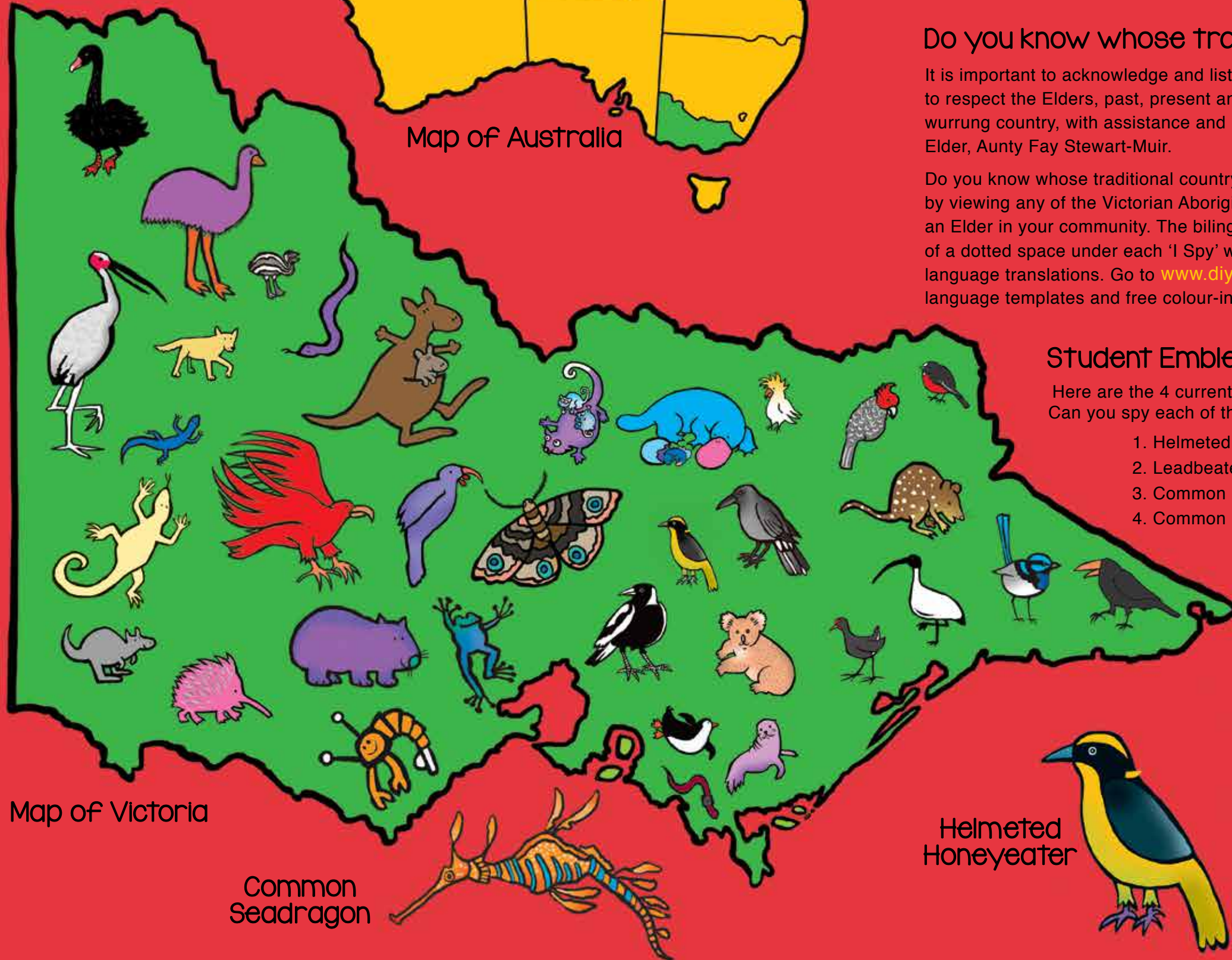
Map of Victoria